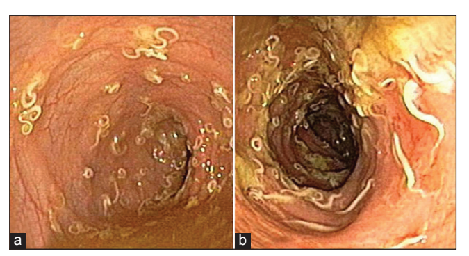
Figure 2: Colonoscopic picture of Extensive Trichuriasis involving the terminal ileum and the entire colon

Since our patient did not come back for further follow up, she did not receive periodic deworming which is recommended in such cases to prevent reinfection or relapse of symptoms. [6] Further the other members of the family need screening and periodic deworming as they may probably act as the source of her persistent infection. Also