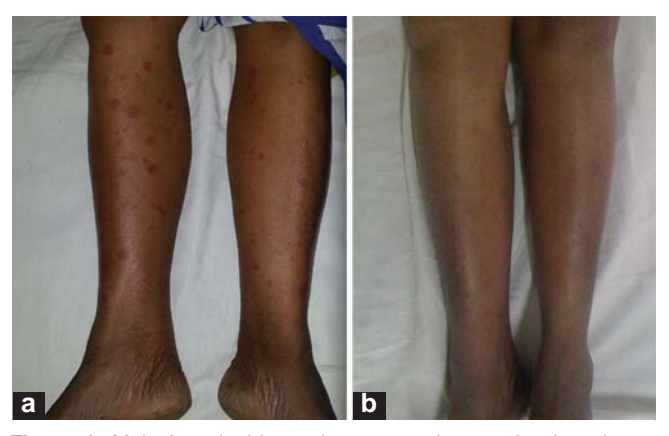
Figure 1: Multiple palpable erythematous plaques distributed over both lower limbs (a) and (b) lesions completely resolved after treatment

disease. The clinical severity of scrub typhus ranges from mild to fatal organ failure. The usual clinical features are headache, high fever and myalgia. A non-pruritic macular or papular rash may be seen on the trunk, which can later spread to the face, arms and legs. The various complications known to occur with this disease are acute renal failure, acute hepatic failure, interstitial pneumonitis, acute respiratory distress syndrome , septic shock, myocarditis, pericarditis, meningoencephalitis and also acute hearing loss is reported.<sup>[4,5]</sup>