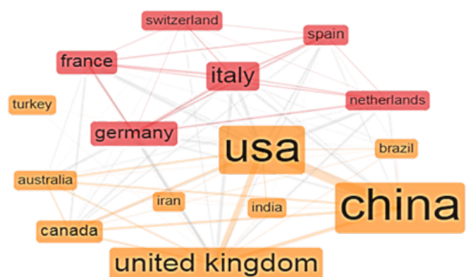
Figure 1: Country Collaboration Networks Chart.

On classifying COVID-19 output by age groups, it was found that the maximum impact of COVID-19 was on “Adults” (15406 papers and 14.95% share), followed by “Middle Aged” (10910 papers and 10.59%