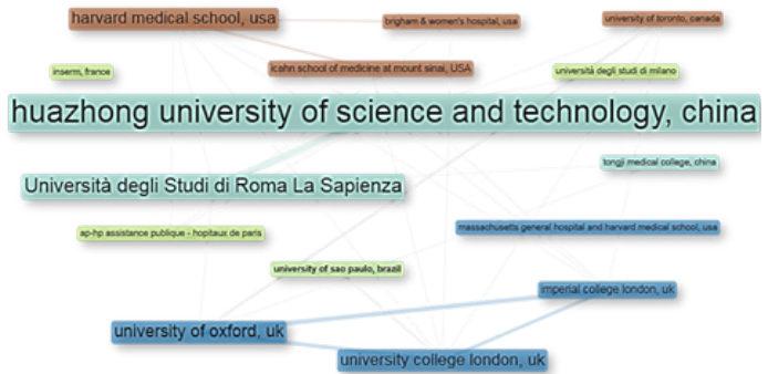
Figure 3: Organization Collaboration Network Chart.

University of S&T, China - Tongji Medical College, China registered the highest number of collaborative linkages (1222), followed Harvard Medical School, USA - Brigham and Women’s Hospital, USA (570 links), Harvard Medical School, USA - Massachusetts General Hospital, USA (557 links), INSERM, France - AP-HP Assistance Publique - Hopitaux de Paris (464 links), Massachusetts General Hospital, USA - Brigham and Women’s Hospital, USA (163 links), University of Oxford, U.K. - Imperial College, London, U.K. (100 links), Harvard Medical School, USA - Icahn School of Medicine at Mount Sinai, USA (63 links), etc.