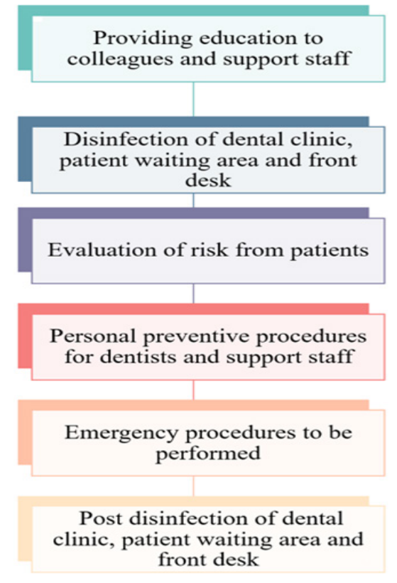
Figure 2: Guidelines during periodontal settings.